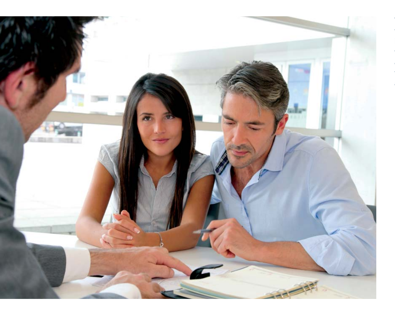
The Germans know that crises are intrinsic to the way the economy works, and we will come through this crisis, I am convinced!

In the world of risks, where is the business heading to for brokers in the future? Where does your research department see the potential? What are the big challenges?